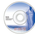
Programming Software (Dealers Only)