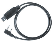
USB Programming Cable PC03